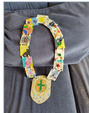
Chains of Office made by each team - Scissors, Hammers, First Aid

Outdoor activities and challenges are always popular, especially anything involving water!