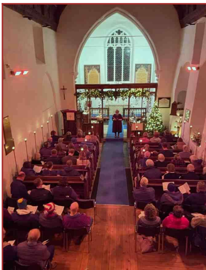
Our Christmas Eve Service of Nine Lessons and Carols